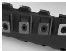
Authentic Oliver HCX Helical shearing cutterhead with 15mm 4-sided inserts. Not segmented or spiral.