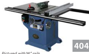
Pictured with 36" rails