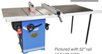
Pictured with 52" rail and side table