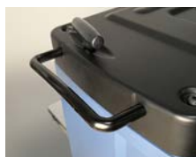
NEW steel top and heavy-duty handles for easier carrying.