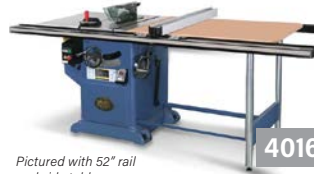
Pictured with 52" rail and side table