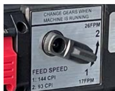
NEW two-speed gear box to maximize cut quality and provides different feed rates.