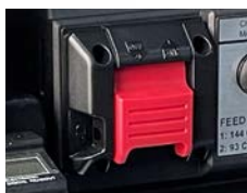
Updated heavy-duty safety switch with built-in safety lock-out.