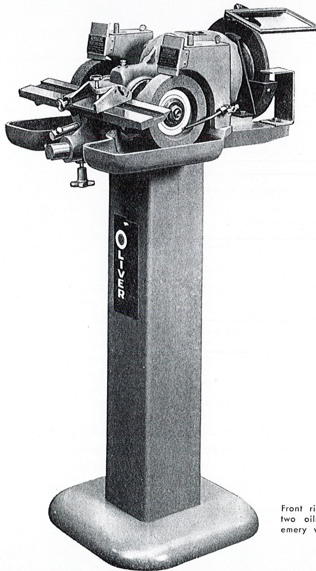
Front right side view — note two oilstone grinding wheels, emery wheel and tool holder.